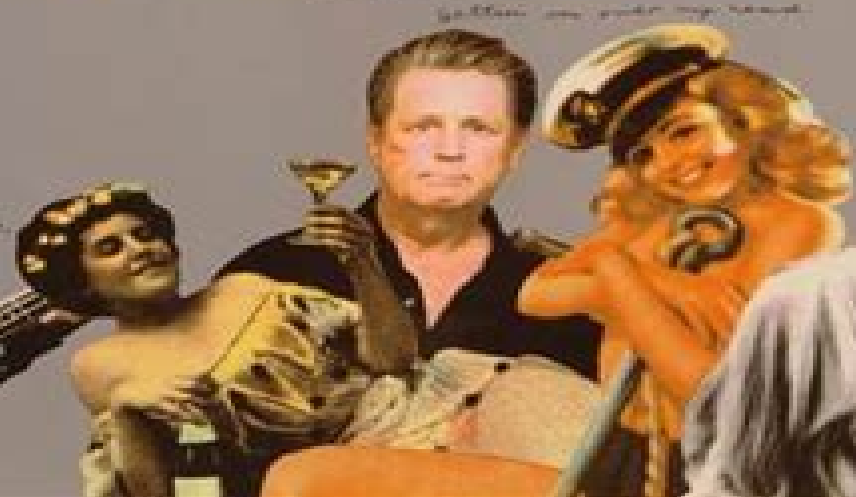
Love trouble me