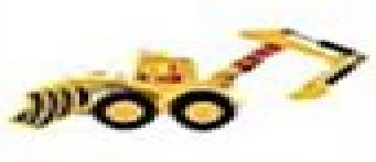
la excavadora digger