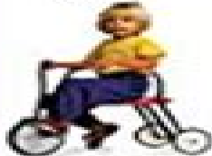
el triciclo tricycle