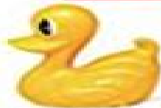
el patito duck