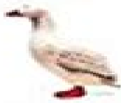
el ganso goose