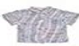
la camisa shirt