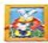
el cuadro picture