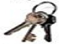
las llaves keys