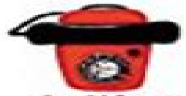
el teléfono telephone