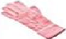
el guante glove