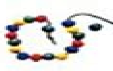
la pulsera bracelet