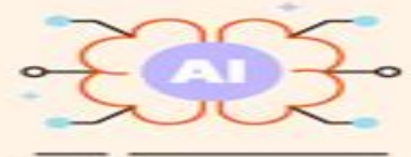
Using AI-generated content in agent responses