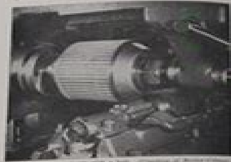
The hob cutting gear teeth with a rack cutter of American type. The curved form of the gear teeth are generated by the rolling action of the gear on each tooth of the gear follows the helical space in the hob. A full view of a hob is shown in Fig. 129.

Figure 129 shows a hob cutting several large gears on a hobbing machine.