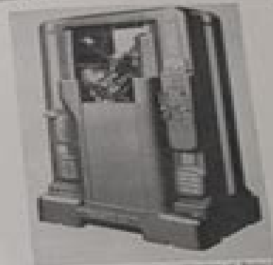
Fig. 129. A hobbing machine.

When used to cut external gear teeth the hob teeth will generate only their basic or pitch. Any portion of teeth that the generator with a given hob, the amount of being determined by the nature of the construction of the hob for the construction of