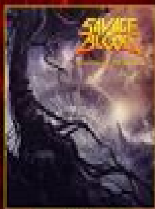
Warriors Of The Fortress digital single not new on all common platforms