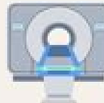
X-ray computed tomography