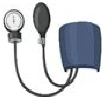
Elevated Blood Pressure