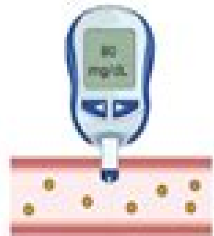
Type 2 Diabetes Mellitus