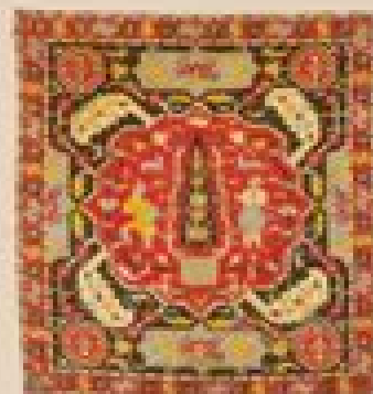
SELTENE ORIENTTEPPICHE X EBERHART HERRMANN