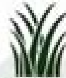
Timothy & orchard grass