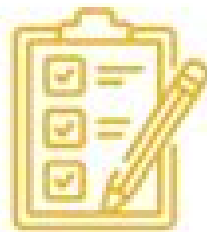
Planning for the future