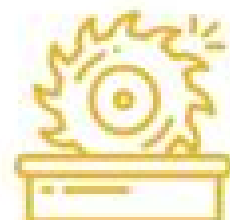
Sharpening your saw