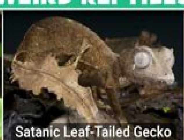
Satanic Leaf-Tailed Gecko