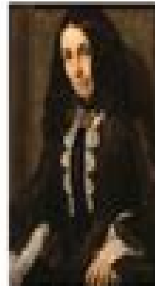
Elizabeth Barrett Browning