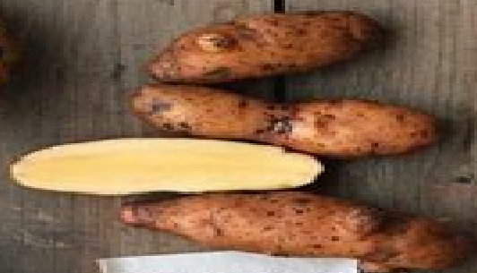
PINK FIR APPLE