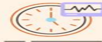
Wait time monitoring