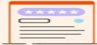
Competitor review assessment