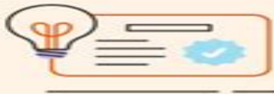
Automating agent action recommendations