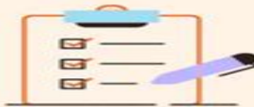
Machine learning for inventory management