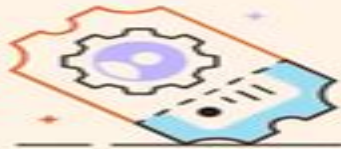
Support ticket organization