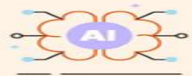
Using AI-generated content in agent responses