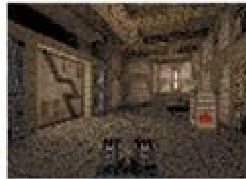
Radiance Texture + Light Map