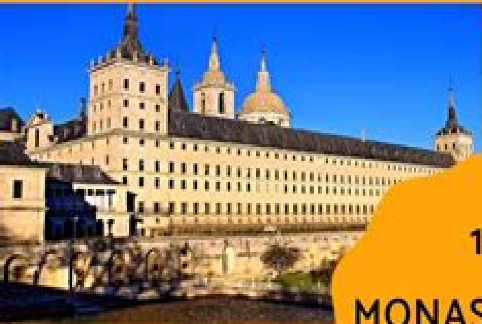
MONASTERIO DE EL ESCORIAL