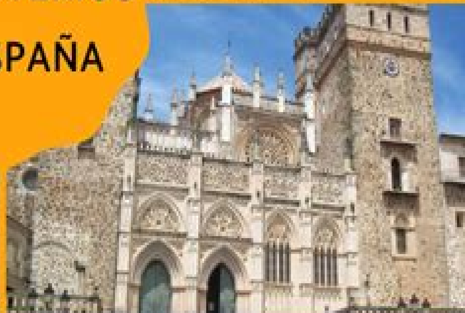
MONASTERIO DE SAN JUAN DE LA PEÑA