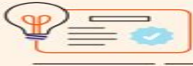
Automating agent action recommendations