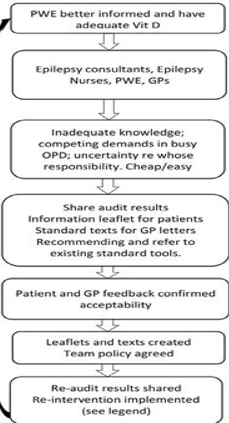
B: Bone health in epilepsy example