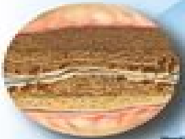
Viewed in the late stage of chronic polyarthritis, the distal interphalangeal joint exhibits the nodular joint of the finger with destroyed joint surfaces.

Joint inflammation accompanying psoriasis This condition, known as psoriatic arthritis, is associated with the autoimmune disease psoriasis. It causes inflammation in the joints, often leading to swelling, pain, and stiffness. Unlike rheumatoid arthritis, it can affect the distal interphalangeal joints (the joints at the ends of the fingers and toes). Treatment typically involves anti-inflammatory medications and disease-modifying antirheumatic drugs (DMARDs).