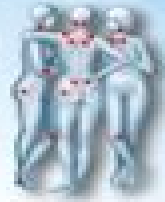
Tender points in rheumatism

Soft tissue rheumatism This is a group of conditions that affect the soft tissues of the body, including the tendons, ligaments, and bursae. It is characterized by inflammation and pain in these areas. The conditions are often associated with autoimmune diseases and can be treated with anti-inflammatory medications and physical therapy.