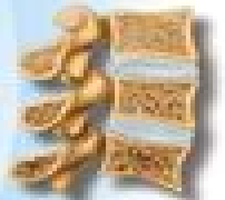
Working with ankylosing spondylitis, the grade of loss of sitting posture from top to bottom is illustrated.

Psoriatic arthritis with rheumatoid nodules This is a form of psoriatic arthritis that is characterized by the presence of rheumatoid nodules. These are small, firm, painless lumps that are typically found on the fingers and toes. They are made of a thick, fibrous material that can erode the underlying bone and cartilage. The disease is more common in people with psoriasis and is associated with the HLA-B27 gene.