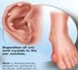
Inflammation of the ear and arthralgia in the ear nodules.