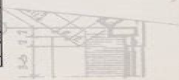
CORNER REAR ENTRY LOWER LEVEL - ACT. BID