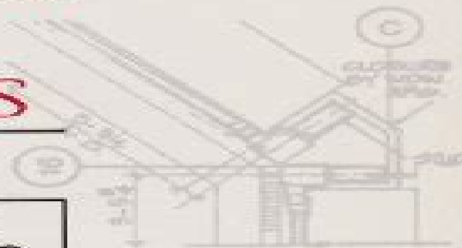
CORNER REAR ENTRY LOWER LEVEL - BASE BID