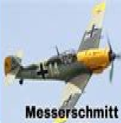
Messerschmitt Bf 109