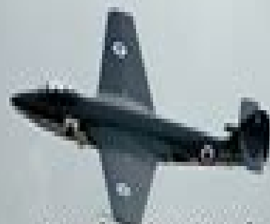
Hawker Sea Hawk