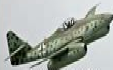
Messerschmitt Me 262