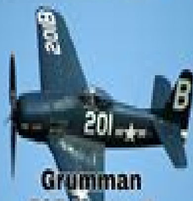
Grumman F8F Bearcat