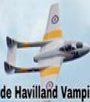
de Havilland Vampire