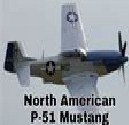
North American P-51 Mustang