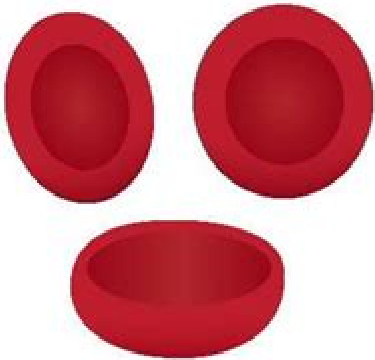
NORMAL RED BLOOD CELLS