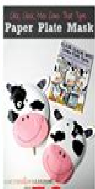
Old, Old, No One, But Yes, Paper Plate Mask