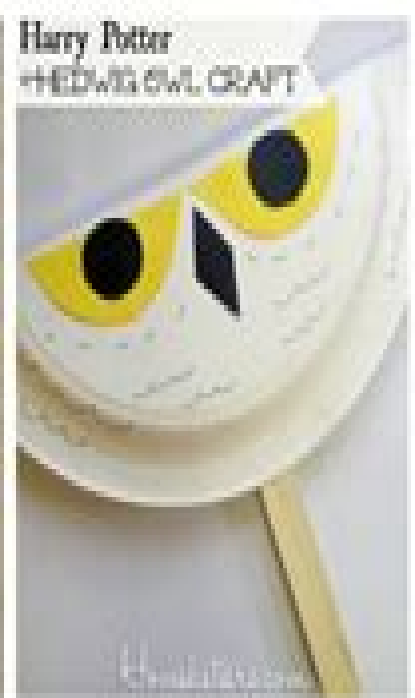
Harry Potter HEDWIG OWL CRAFT