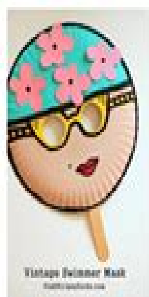
Vintage Swimmer Mask craftideas.com