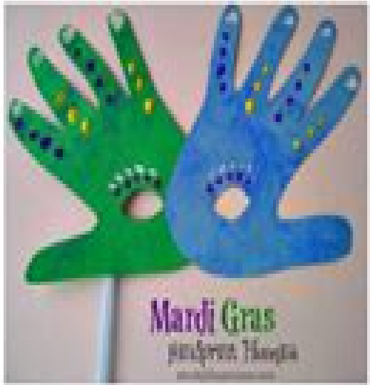
Mardi Gras Handprint Masks