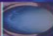
Cataract and Refractive Surgery