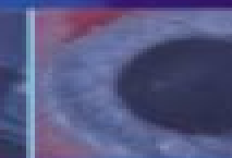
Cornea and External Eye Disease