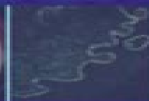
Uveitis and Immunological Disorders