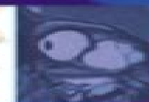
Pediatric Ophthalmology, Neuro- Ophthalmology, Genetics