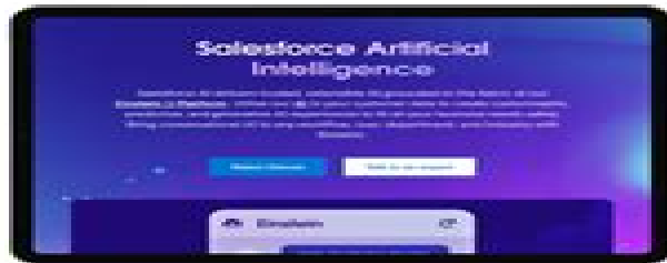
CRM software (Salesforce Einstein)