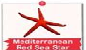
Mediterranean Red Sea Star