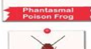
Red Flat Bark Beetle