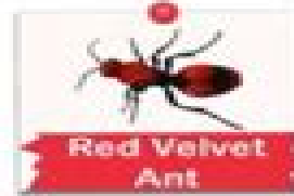
Red Velvet Ant