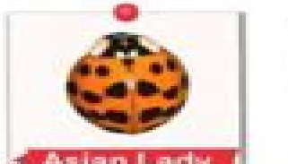
Asian Lady Beetle