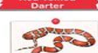
Red Milk Snake