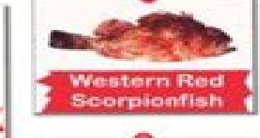
Western Red Scorpionfish