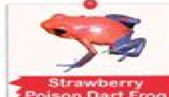
Strawberry Poison Dart Frog