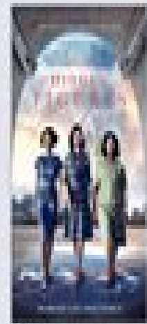
Hidden Figures Shetterly, Margot Lee