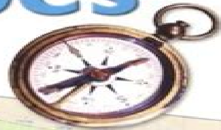
Directions Students in Room 9 Travel to Get Home From School