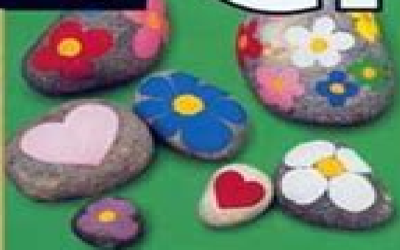
art and craft