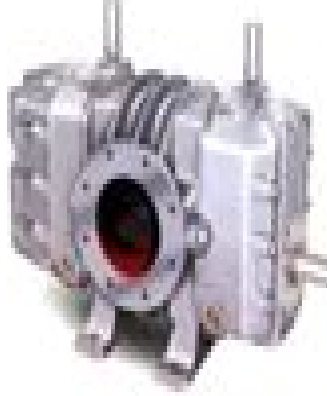
Root Type Pump