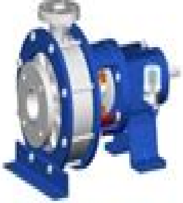
Radial Flow Pump