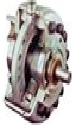
Radial Piston Pump