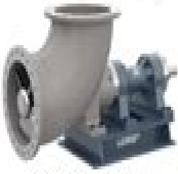
Axial Flow Pump