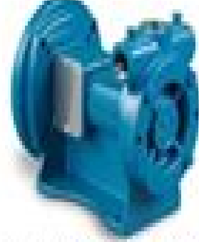
Regenerative Turbine Pump