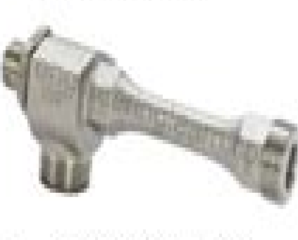
Eductor Jet Pump