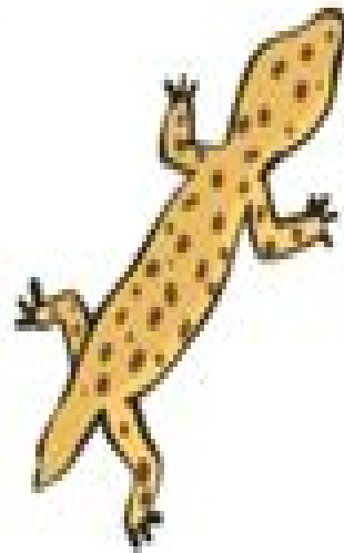
Regrowing tail after 4 weeks