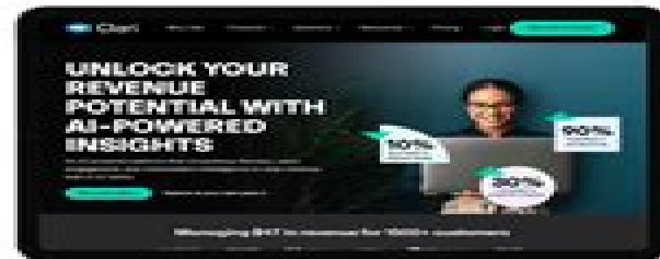
Sales management platform (Clari)