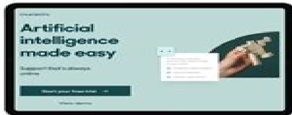
Customer support chatbot (Zendesk Answer Bot)