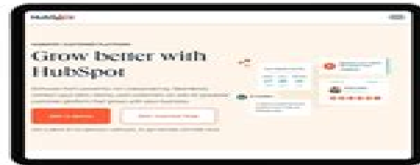
Marketing automation app (HubSpot)