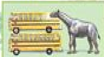
The largest land mammal that ever lived was part of the rhino family. It was about 18 feet tall at the shoulder and 48 feet long—roughly the size of two school buses! This giant is called Indricotherium (or Ailurotherium ).

The first rhinos lived about 60 million years ago. They were very small and looked like the ancestors of horses. They did not have horns, and many rhinos that came after them did not have horns either. Some ancient rhinos had much longer legs than today's rhinos, and some had much shorter legs. Can you find some other differences between ancient and modern rhinos?