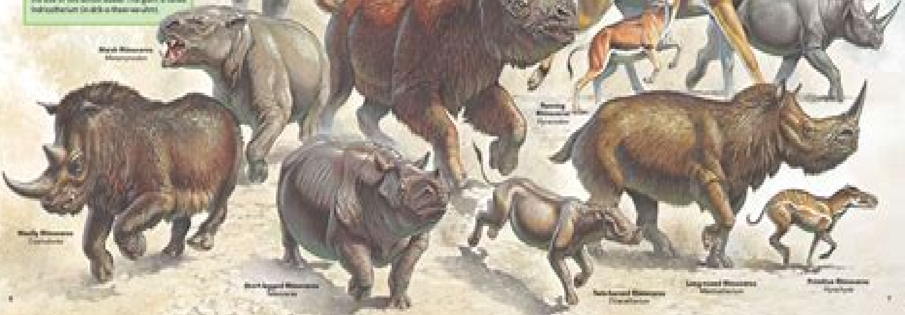
North American Rhinoceros

At one time or another, ancient rhinos lived on many of the world's continents, even the green areas on the map. As far as we know, there have never been rhinos in South America, Australia, or Antarctica.