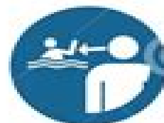
WSM002 SUPERVISE CHILDREN DURING AQUATIC ACTIVITIES