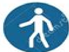
D-M010 FOR PEDESTRIANS