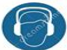
D-M003 USE HEARING PROTECTION