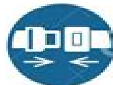
D-M011 USE SAFETY BELT