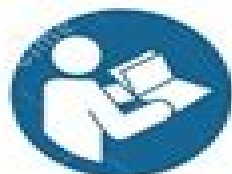
D-M018 READ OPERATING INSTRUCTIONS