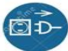
D-M013 PULL MAINS PLUG BEFORE OPENING