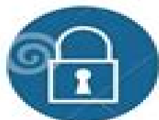
D-M019 LOCK OUT