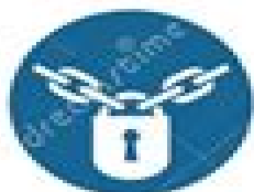
D-M020 LOCK OUT