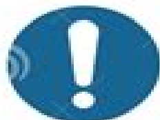
D-M000 GENERAL MANDATORY