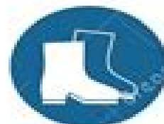
D-M005 USE FOOT PROTECTION