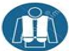
D-M015 USE LIFEJACKET