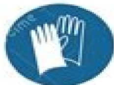
D-M006 USE HAND PROTECTION