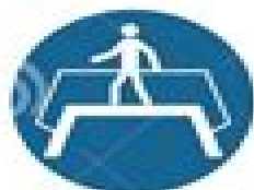
D-M012 USE TRANSITION