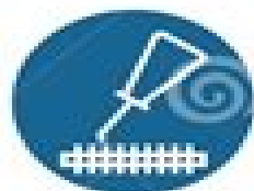
D-M016 LUBRICANTS POINT