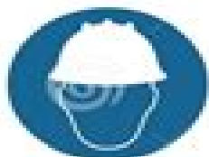
D-M002 USE SAFETY HELMET