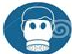
D-M004 USE RESPIRATORY PROTECTION