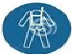
D-M009 USE HARNESS