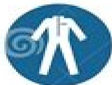
D-M007 USE PROTECTIVE CLOTHING