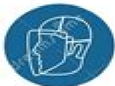
D-M008 USE FACEGUARD