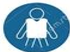
WSM001 USE LIFEJACKET