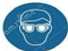
D-M001 USE EYE PROTECTION