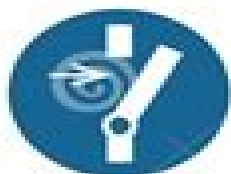
D-M014 UNLOCK BEFORE WORK