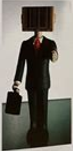
Figurine de l'artiste, 2004. (5) : 100% PVC, 15 cm de haut. (6) : 100% PVC, 15 cm de haut. (7) : 100% PVC, 15 cm de haut. (8) : 100% PVC, 15 cm de haut.