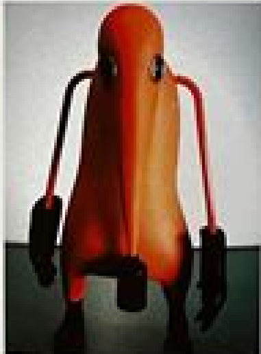
Figurine de l'artiste, 2004. (1) et (2) : 100% PVC, 15 cm de haut. (3) : 100% PVC, 15 cm de haut. (4) : 100% PVC, 15 cm de haut.