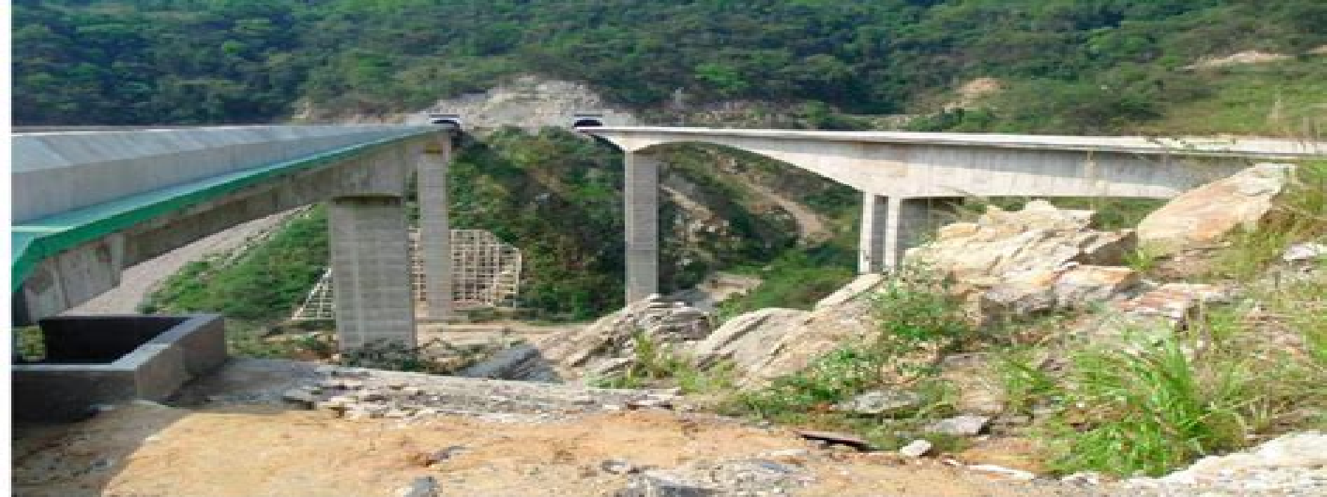
(a) Real bridge structure picture.