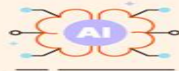
Using AI-generated content in agent responses