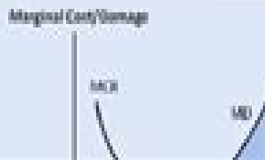
Figure 8.1 The Optimal Level of Pollution

Equi marginal principle = the balancing of marginal costs and marginal benefits to obtain an