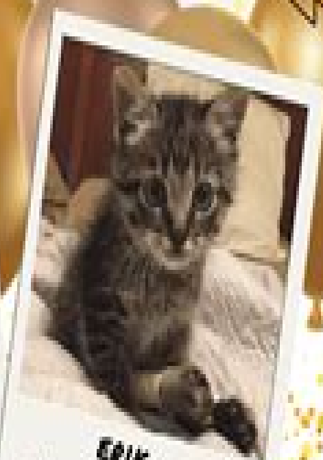
ERIK CLASS OF 2022