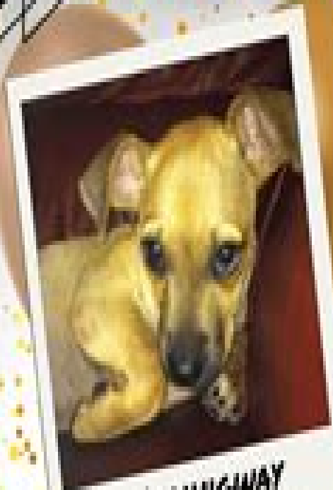
HEMINGWAY CLASS OF 2013