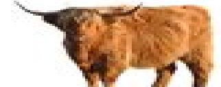
Scottish Highland Cattle