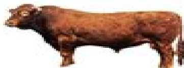
South Devon Cattle