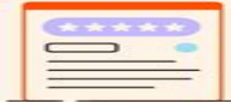
Competitor review assessment