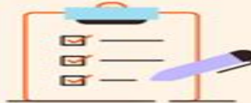
Machine learning for inventory management