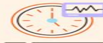
Wait time monitoring