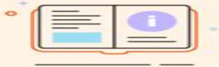
Customer self-service chatbots