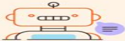
Customer service chatbots for common questions