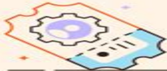
Support ticket organization