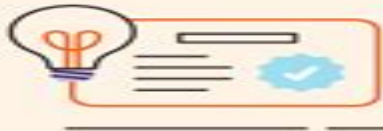
Automating agent action recommendations