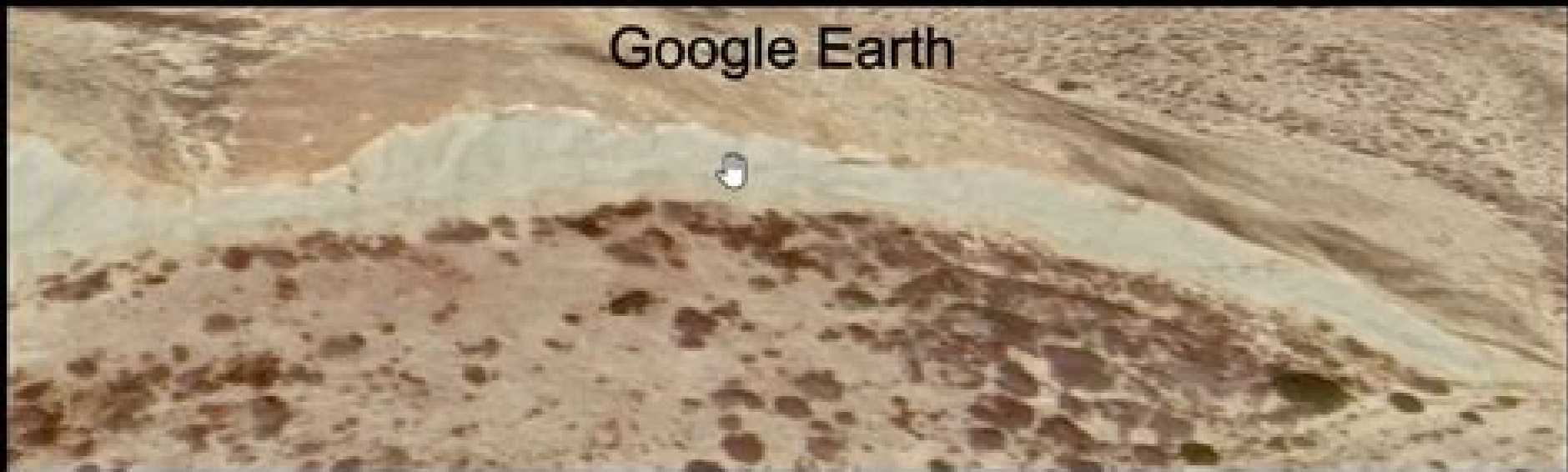
3D digital model