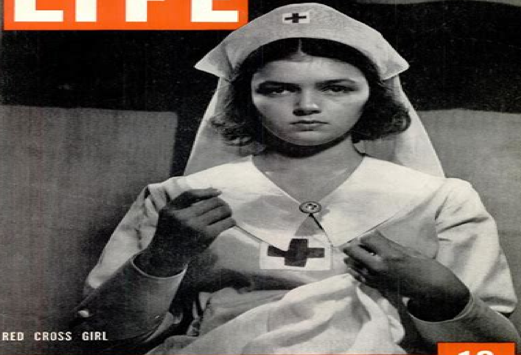
RED CROSS GIRL