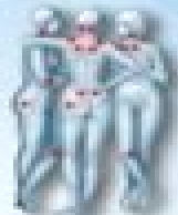
Neck joints in rheumatoid arthritis

Self-healing rheumatic diseases are a group of conditions that affect the joints and are characterized by their ability to resolve themselves over time. These conditions include acute rheumatic fever, streptococcal toxic shock syndrome, and erythema nodosum. The inflammation is typically caused by a bacterial infection, and the disease resolves itself as the body's immune system fights off the infection.