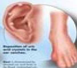
Swelling of the hand joints in the early stages.

Joint inflammation (synovitis) is a general term for inflammation of the synovial membrane, which is the lining of the joint. It is characterized by the formation of synovial nodules, which are small, firm lumps of tissue that develop under the skin. The disease is most common in the hands and wrists, but it can also affect other joints, such as the knees, hips, and ankles. The inflammation causes the joints to become swollen, painful, and stiff, especially in the morning. Over time, the disease can lead to joint damage and deformity.