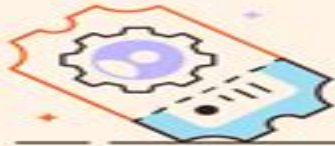
Support ticket organization