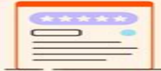
Competitor review assessment