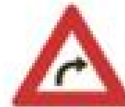
RIGHT HAND CURVE