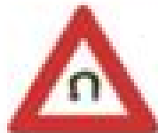
LEFT HAIR PIN BEND