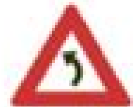
LEFT HAND CURVE