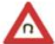
RIGHT HAIR PIN BEND