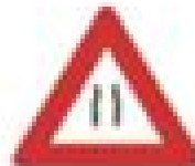
NARROW ROAD AHEAD