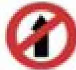
STRAIGHT PROHIBITOR NO ENTRY