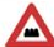
HUMP OR ROUGH