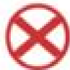
NO STOPPING OR STANDING