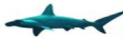
Scalloped Hammerhead Shark