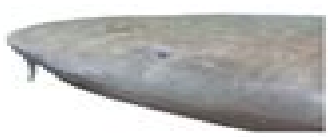
Tawny Nurse Shark