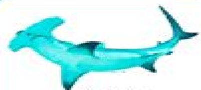
Great Hammerhead shark