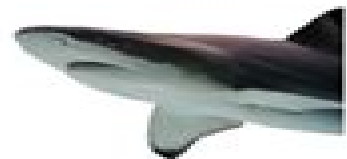
Gray Reef Shark