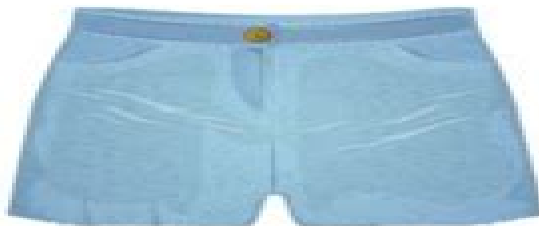
Light-washed denim shorts