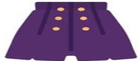
Tailored sailor shorts