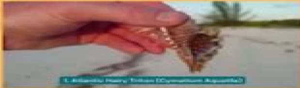
1. Atlantic Heavy Earshell ( Cyrenoida bipartita )