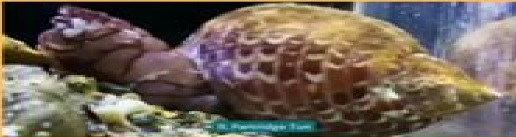
11. Atlantic Tull