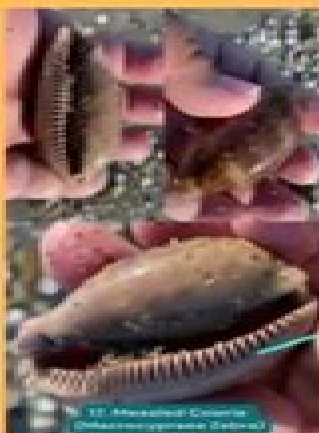
15. Atlantic Cowrie ( Cypraea spinea )