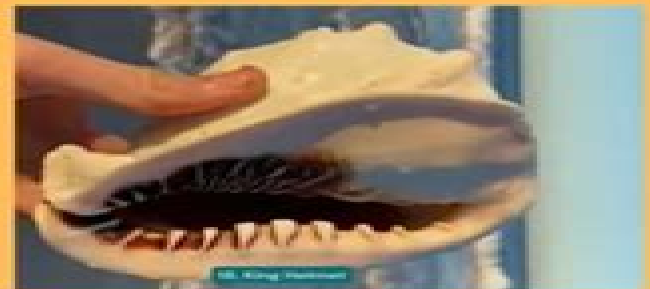
18. King Murex