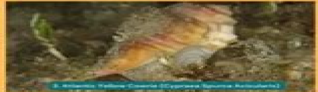
3. Atlantic Yellow Cowrie ( Cypraea spinea Acicula )