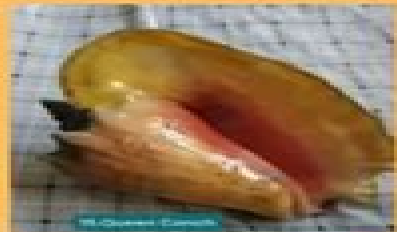
17. Atlantic Cowrie