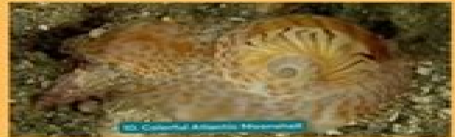
10. Coastal Atlantic Murex