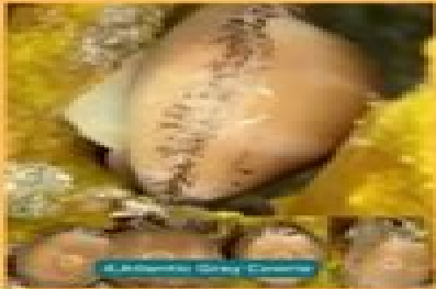
4. Atlantic Gray Cowrie