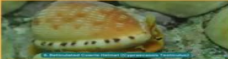
9. Bathurst Cowrie Helmet ( Cypraea Testudinifera )