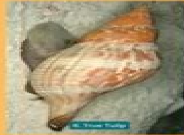
6. True Tully