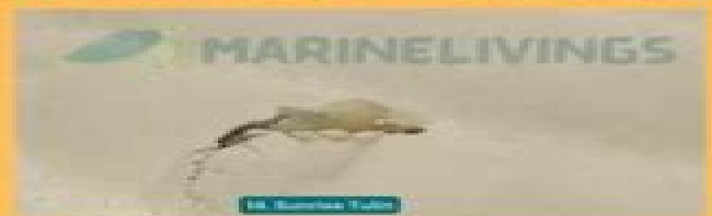
16. Atlantic Tull