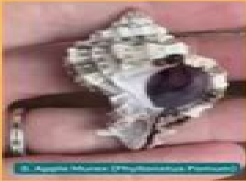
5. Apple Murex ( Physiculus Parthicus )