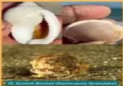
13. Atlantic Murex ( Physiculus Parthicus )