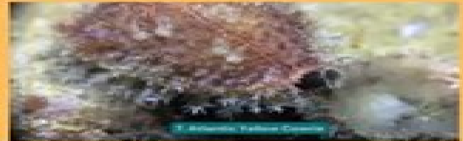
7. Atlantic Yellow Cowrie