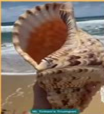
14. Atlantic Murex